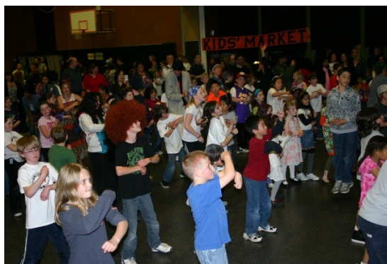
Students in Redmond dancing at the end of another successful Friendship Week in 2010

Our foundation is a non-profit organization with many active board members. We are able to fund the Friendship School through partnerships with Rosa Parks Elementary and other local schools, local community support, and donations & sponsorships from supporters like you.